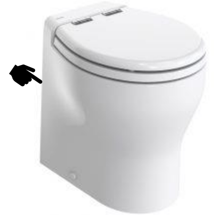
TECMA® silence plus 2g