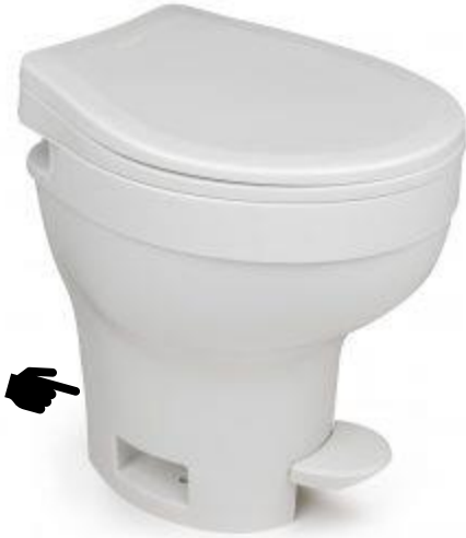
AQUA-MAGIC® VI pedal flush