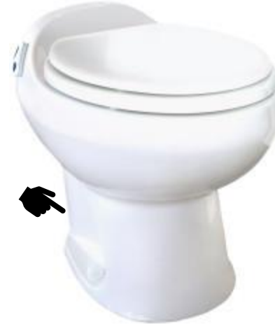
ARIA® deluxe II