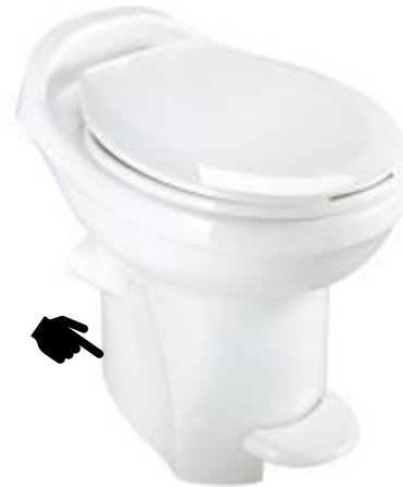
AQUA-MAGIC® style plus