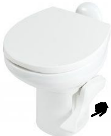
AQUA-MAGIC® style ii