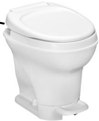
AQUA-MAGIC® V foot flush